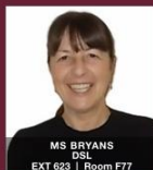
MS BRYANS 024 EXT 623 | Room F77